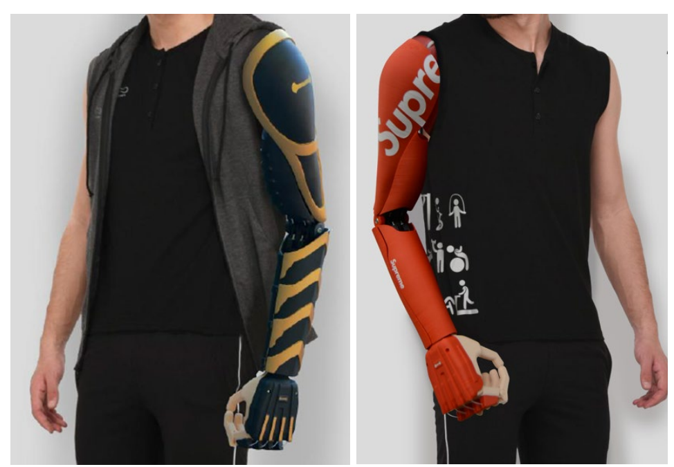
Figure 1. An example of an open-source shoulder disarticulation prosthetic design-based 3D printer that has been developed by iDIG Laboratory (Kuswanto et al., 2019)